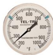
5" ALUMINUM DIAL with REFLECTIVE CLIPS and POINTER: