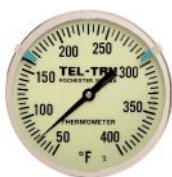
5" GLOW DIAL with REFLECTIVE CLIPS and POINTER: